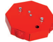
PIP-1AN/O,375A OR PIP-3AN/O,75A