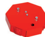
PIP-1AN/O,375A OR PIP-3AN/O,75A