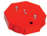
PIP-1AN/O,375A OR PIP-3AN/O,75A